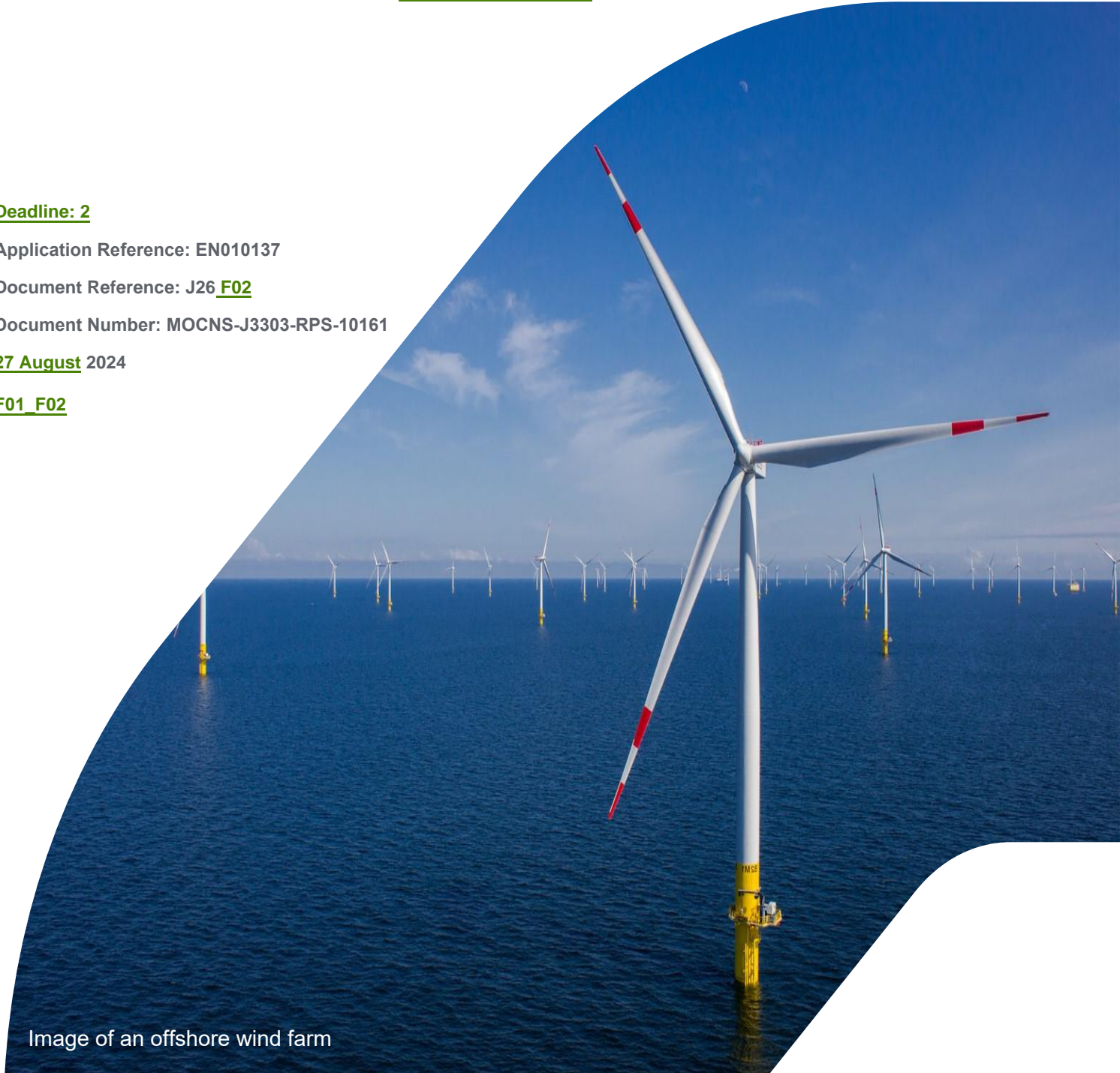
Image of an offshore wind farm